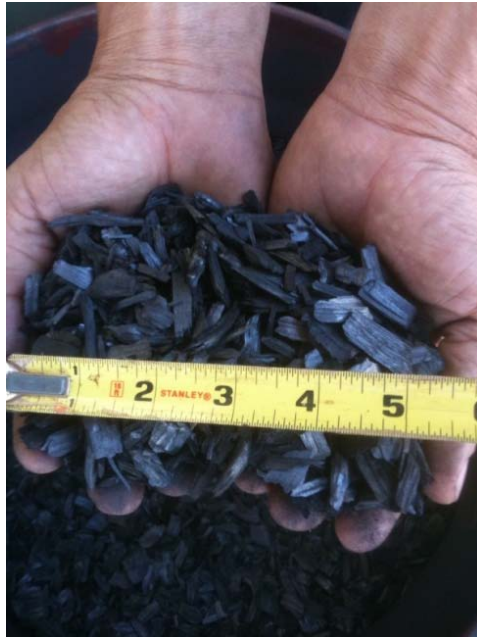
Figure 5. Biochar product produced by the TSY-Peak system.

The operators of the TSY-Peak project plan to sell the biochar to research universities, to apply the char to portions of their own forests 15 to 50 miles away, and to sell the biochar for other horticultural applications.