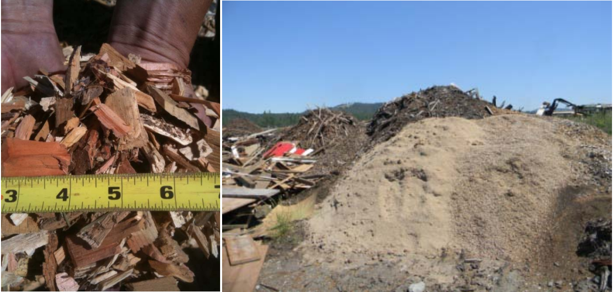
Figure 3. Wood waste used in the TSY-Peak biochar system. Left is the hog fuel used to power the gasifier. Right is the waste biomass currently left to rot in the log yard, which feeds the pyrolytic retort.