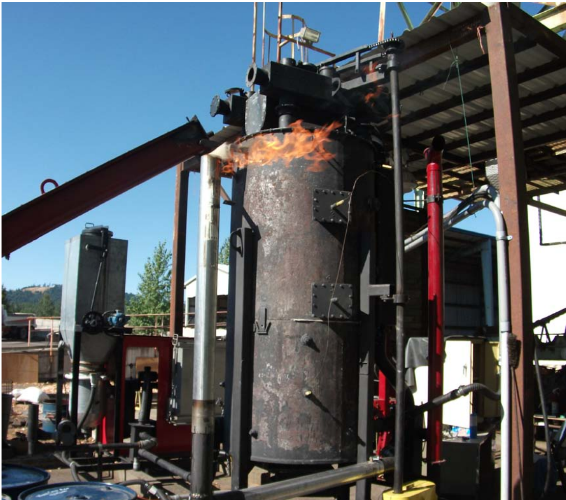
Figure 2. Fluidyne Gasifier (left background, metallic surface) and pyrolytic retort (right front, black paint) in the log-sorting yard of Thompson Timber/Starker Forest, Philomath OR.

A Fluidyne Pacific Class down-draft gasifier provides thermal drive for the entire system. The gasifier utilizes a small portion of the oversized wood chips that are screened out during the chipper plants' sorting process. These chips are air dried to 15% moisture. Wood chips are thermally reduced in a high temperature, low oxygen environment, to yield a relatively low heat value combustible gas known as producer gas. At approximately 164 BTU per standard cubic foot, producer gas by volume has around one-seventh the heat energy of natural gas. However using this pathway the thermal requirements of the pyrolytic retort can be achieved with low value biomass. The gas is ignited and then used to heat the pyrolytic retort.