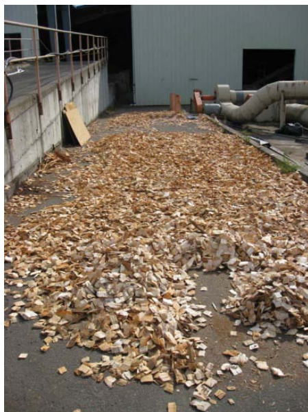
Figure 4. Air-dried hog fuel used in the TSY-Peak biochar system

Oversized wood chips that are dried to 15% moisture content are loaded into the top of the gasifier. A small bed of charcoal is placed at the bottom of the gasifier manifold. The gasifier is started by turning on the blowing motor which forces air over the charcoal bed. The draft mechanism draws a sub-stoichiometric amount of ambient air across the hearth of charcoal which is then lighted by a propane torch. This results in a high temperature oxidation zone with a lower temperature (about 850° C) anoxic reduction zone just below. Combustible producer gas, the outcome of this gasification process, is fed through a high temperature flexible hose (approximately 2 inches in diameter) to a burner inserted in the base of the PR. The resulting ~ 1200° C flame and combustion gases circulate around the outside of the inner PR tube.